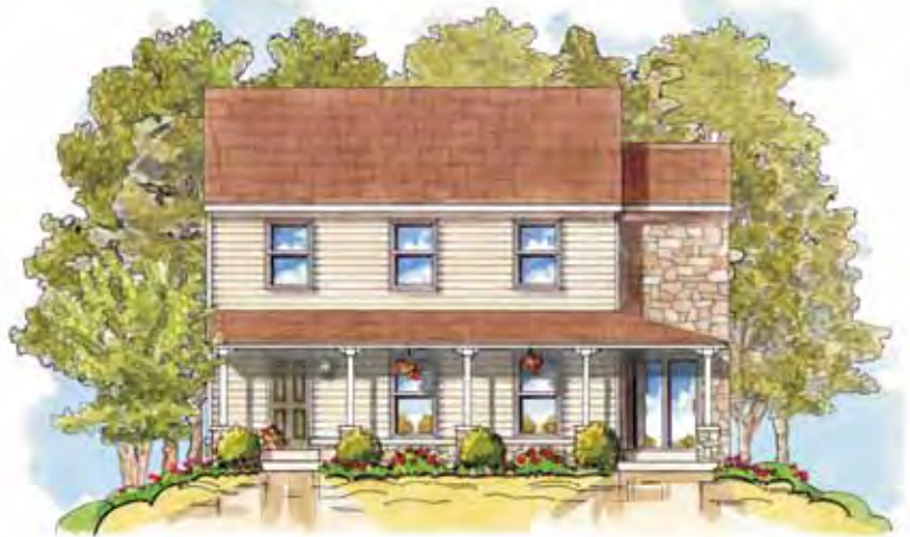
Renderings are for illustration purposes only and may include upgrade options.