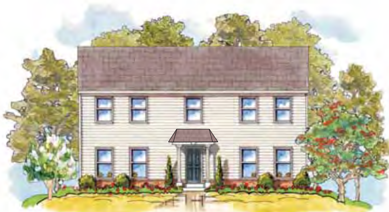
Renderings are for illustration purposes only and may include upgrade options.